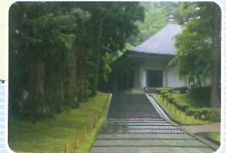
World Heritage Site Hiraizumi Chuson-ji Konjikko (Hiraizumi, Iwate)