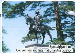
Aoba Castle Site (Sendai, Miyagi)