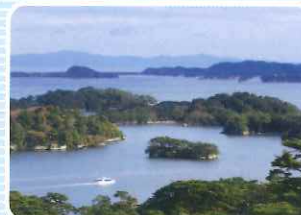
100 Landscapes of Japan Matsushima (Matsushima, Miyagi)