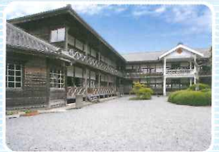
Meiji Village (Tome, Miyagi)