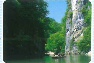
Geibikei Gorge (Ichinoseki, Iwate)